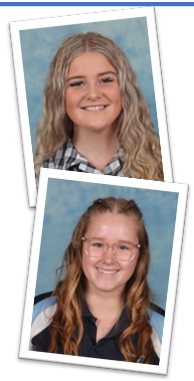
Student Spotlight 2023 College Captains